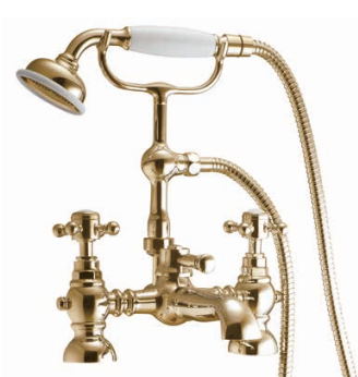
BATH SHOWER MIXER WITH CRADLE BRASS

BRASS002 £450 o.2 Bar Operating Pressure