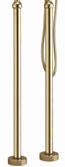
FREESTANDING BATH SHOWER MIXER BRASS

BRASS008 £695 o.5 Bar Operating Pressure