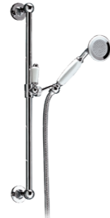
HARROGATE RISER RAIL KIT