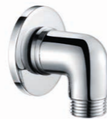
HARROGATE OUTLET ELBOW