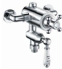
HARROGATE EXPOSED VALVE