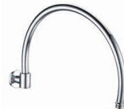
HARROGATE WALL ARM